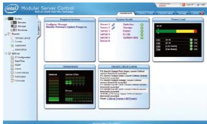
The Dashboard gives an overall system status view within the Modular Server Control