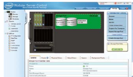
Under the Storage Configuration window, you can create storage pools and virtual drives, as well as map virtual drives to servers