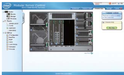
The back view of the chassis allows you to see the status of your modules and power supplies