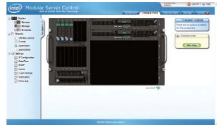
The Virtual Presence Modular Server Control allows you to see the components you physically have loaded in your system—even if they are powered down